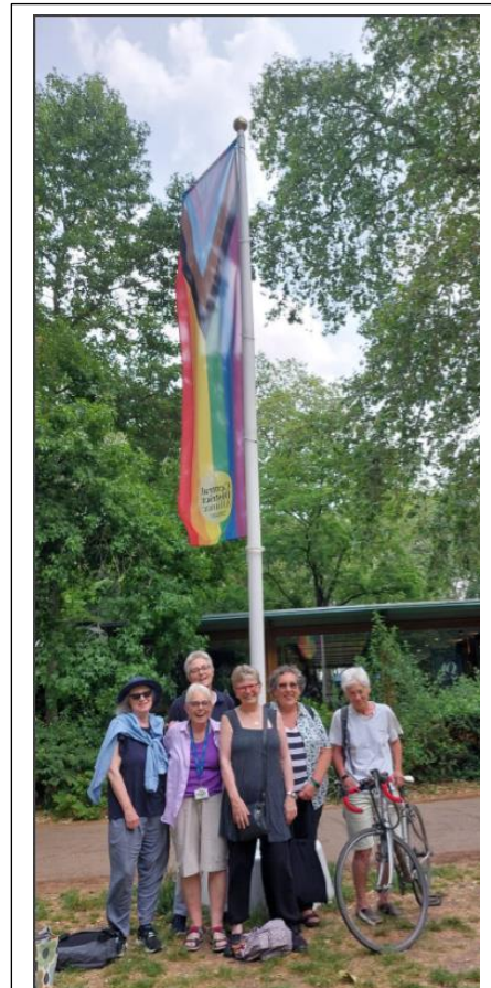
Some members gathered in Russell Square after a LOLC meeting.